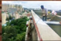
ACTUAL SITE IMAGES BUILDING RESTORATION