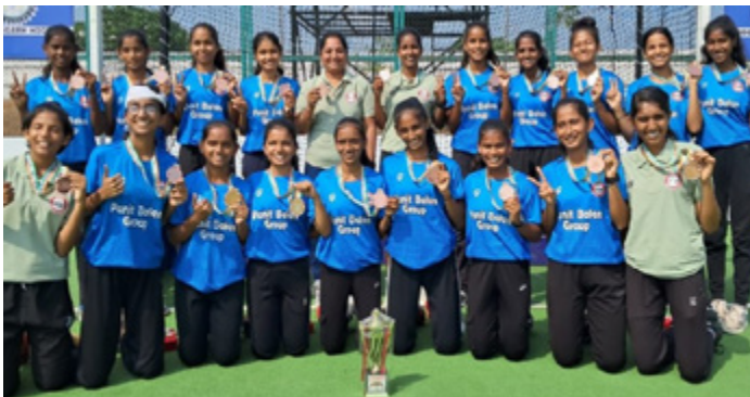
Team Hockey Maharashtra

What a treat to witness top class rink hockey.